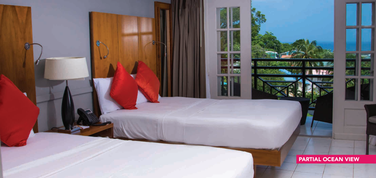
PARTIAL OCEAN VIEW